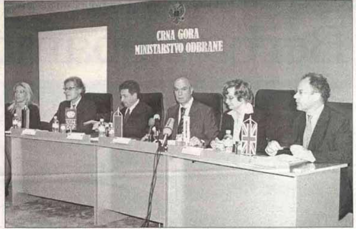
Na jučerašnjoj konferenciji za novinare