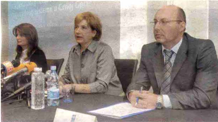
Različiti odgovori građana i predstavnika pravosuđa: Sa prezentacije

Prema njenim riječima, upitani da ocijene korupiranost pravosudnog sistema, nešto više od jedne trećine anketiranih i jedna četvrtina preduzeća ima percepciju da je pravosudni sistem u Crnoj Gori često i uvijek korumpiran. Ipak, podaci o direktnom iskustvu su drugačiji, tako većina ispitanika ističe da strankama ili njihovom